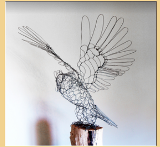
No 8 wire or coat-hanger (or any wire) sculpture

Use pencil Sketched on Country Show Day.