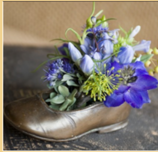
Flower Arrangement in an Unusual Container

Create a miniature scene in your choice of tray.