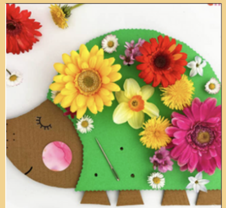
Cardboard Flower & Foliage Animal

Display of flowers & foliage poked through holes