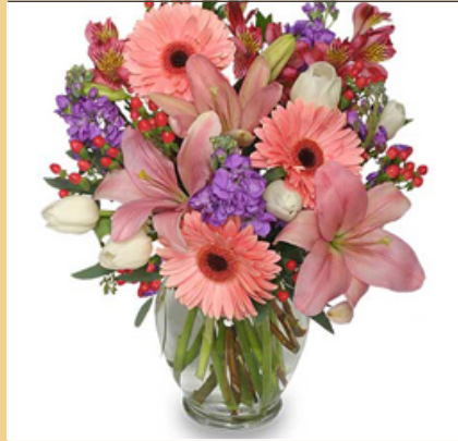
Flower Arrangement in a Container

Flowers/petals and greenery arranged artistically on a vaseline covered saucer.